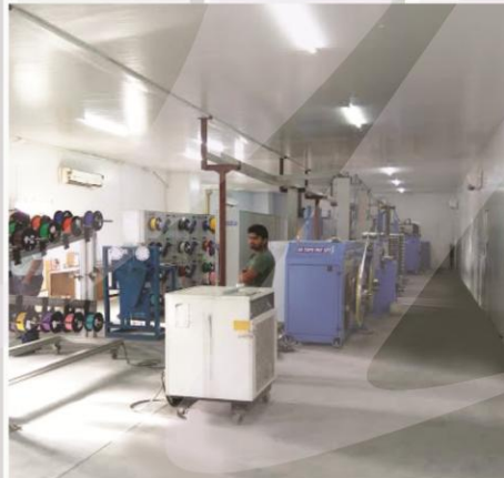
STERLITE TECHNOLOGIES LTD, SILVASSA