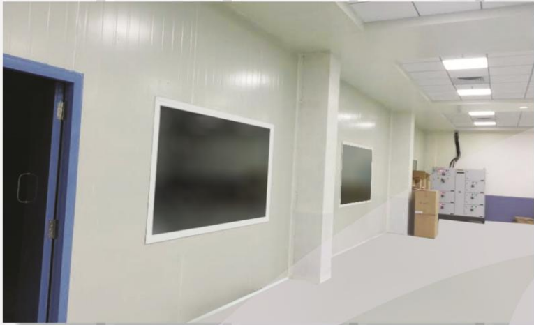
MAHINDRA SONA LIMITED, NASHIK