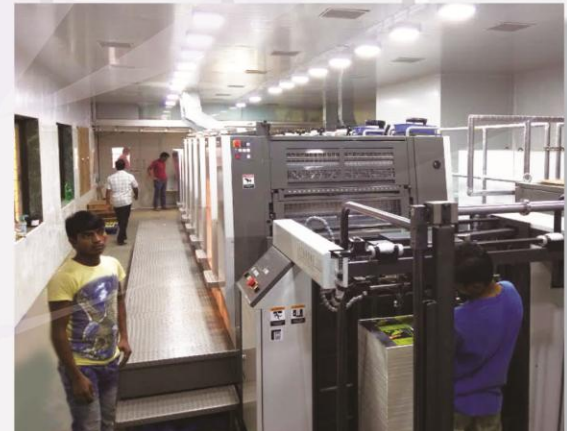
RUCKSON PACKAGING, RABALE