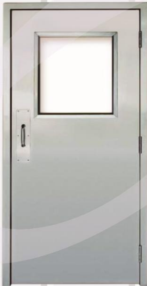
SINGLE LEAF DOOR