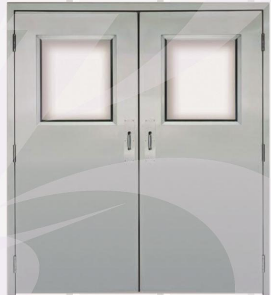
DOUBLE LEAF DOOR