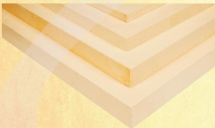
PLAIN PUF SHEETS

For large refrigerated ware houses, a concrete reinforcement is required over PUF Slabs or Bituminised PUF Sheets with tongue and groove for additional strength. In case of very low operating temperatures more than one layer of puf slabs can be used to avoid losses.