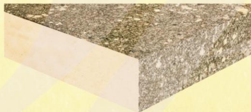
BITUMINISED PUF PANEL WITH TONGUE AND GROOVE